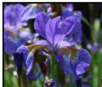
Blue Flag Iris