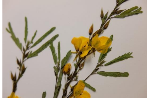
Native Plant and Herbarium Kit