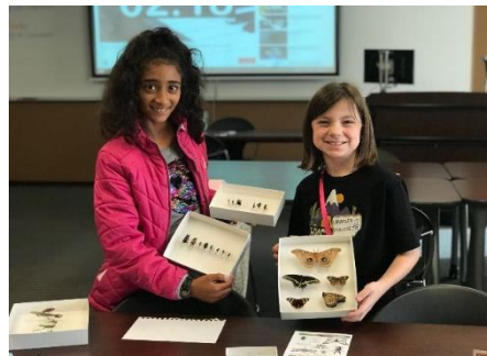
Insect Collection Kit